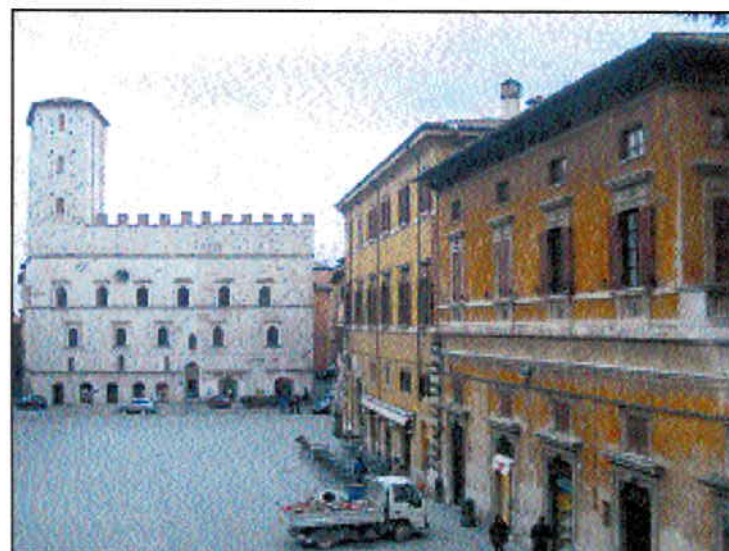
■ The ancient and beautiful Piazza del Popolo.