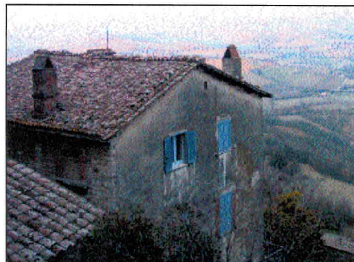
■ A misty early-morning view from a high point in Todi.