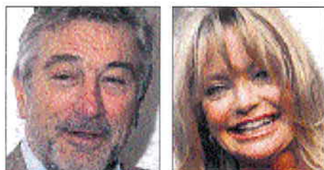
■ Robert De Niro and Goldie Hawn were both impressed by Todi.